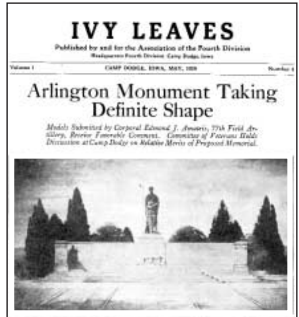
Ivy Leaves, May, 1920 with cover photo of proposed monument.