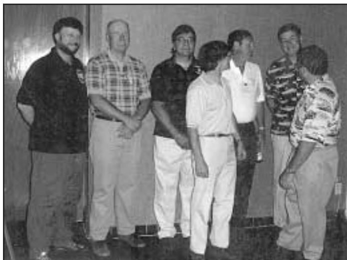
A-1-8 Chapter members.