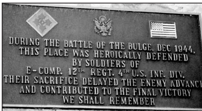
Pictured above is a timeless tribute to "our guys" of WWII. It is permanently affixed to a monument in Echternach, Luxembourg.