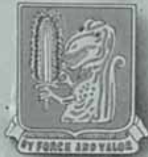
40th Tk Bn