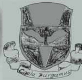
377th AAA (AW) Bn CAC