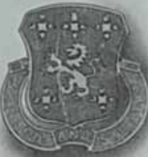
704th Ord Bn