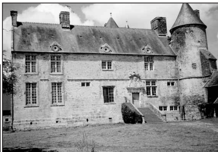
The chateau pictured above was the CP of the 12 Reg. 4ID during the battle to take Montebourg during WWII. It was vacant and apparently abandoned when 4IDA member Bill Buell went back to visit places of his youth. When built (1800's?) it had been the lap of luxury, but became a virtual nightmare of expense to maintain and modernize it with indoor plumbing, heating, and electrification... hence its present situation: deserted.