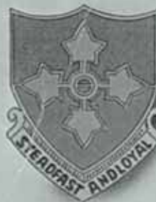
Hq Sp Trps and Hq Div Arty