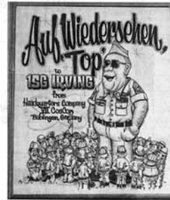
first sergeant from the 4th Infantry Division.