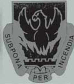
4th STB 3rd BN CT