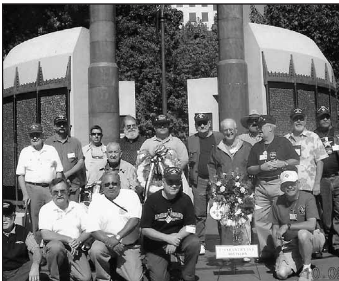
California Chapter Reunion 2005, Sacramento, October 8, California Vietnam Veteran's Memorial.