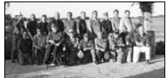
Right: The A/1/8 guys.

Despite the 09-11-01 disaster in New York the A/1/8 Chapter met in San Antonio October 12th -14th and despite our heavy hearts and the last minute cancellation of forty active duty A/1/8 soldiers and color guard scheduled to attend to say we had a great time is really an understatement. Concern over the September 11 attack resulted in only one vet cancellation as most shared the feeling that we were not going to let terrorists win. In fact we had three post 9-11 registrants!