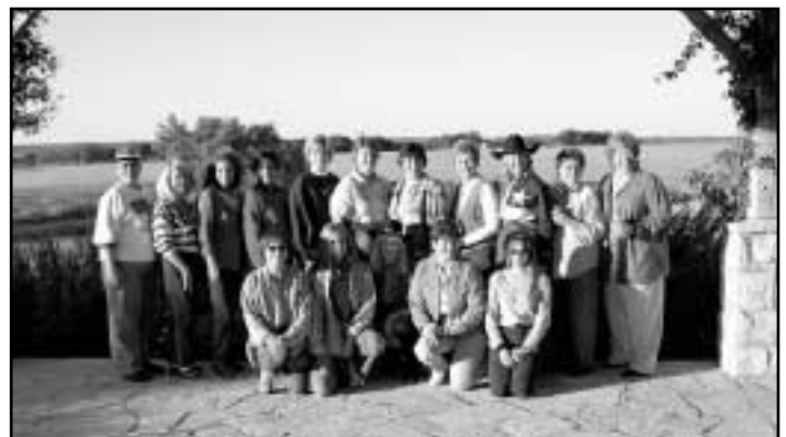
Below: The A/1/8 ladies.

The active duty troopers were of course placed on alert and not allowed to be that far away from Ft. Carson. A recent e-mail says that they are still on alert but except for some specialized training they "haven't gone anywhere and haven't done anything," same old "hurry up and wait!" Sound familiar?