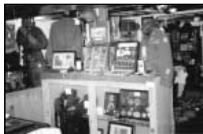
Left Bottom: Display in Butch Maisel's museum.