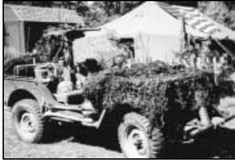
WWII vintage Jeep.