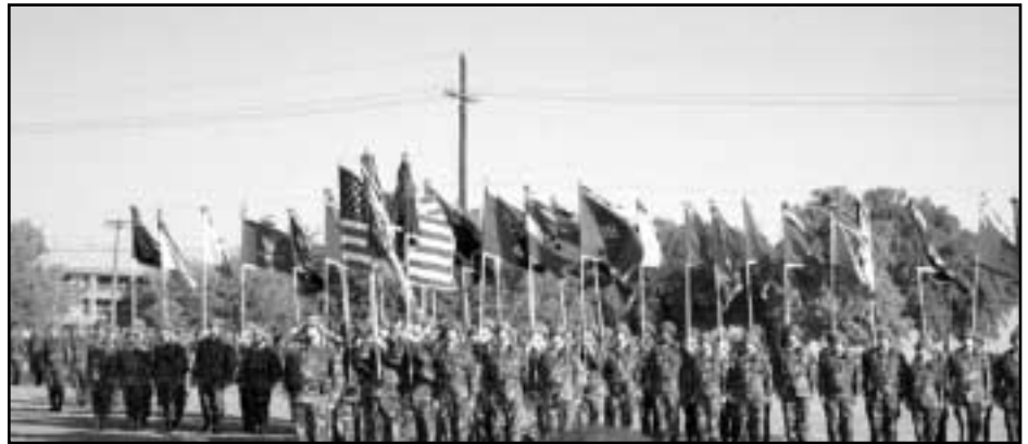
Change of Command ceremony, Ft Hood, TX, October, 2001