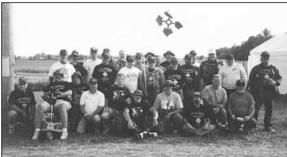
The 4th Division in Kokomo, IN - September, 2001.