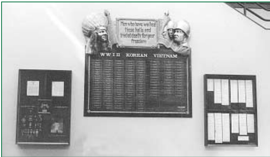
Spokane's North Cental High School hallway memorial reads "Men who have walked these halls and traded death for your freedom."