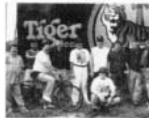
Our first Vietnam Ivy Tour on the road near Tuy Hoa