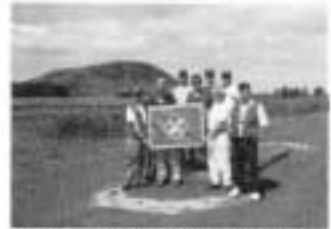
2001 Vets at Dragon Mountain

Email: Gomilspec@aol.com Web: gomilspec.com