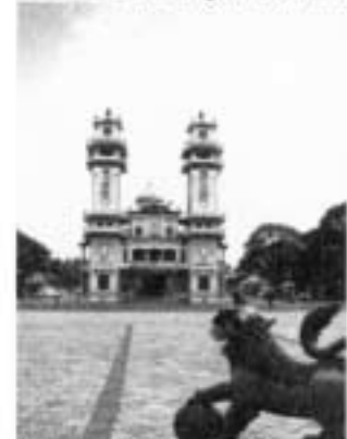
Tay Ninh's Cao Dai Temple