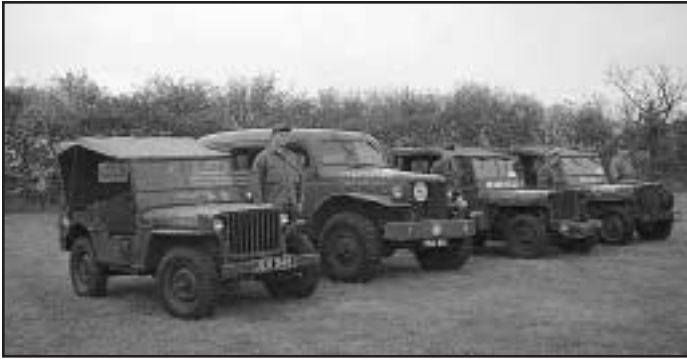
Harrington motorpool. From the left, Colin Wright's '43 GPW, Duncan's '42 Dodge, Chips '62 M201, Howard's '42 Mb.

aim to portray an embarkation control post and have been actively prop building and collecting appropriate equipment and ephemera to display.